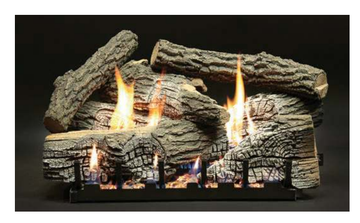
Super Stacked Wildwood Refractory Log Set (LS24WRS) with Vent-Free Slope Glaze Burner System (VFSR-24)