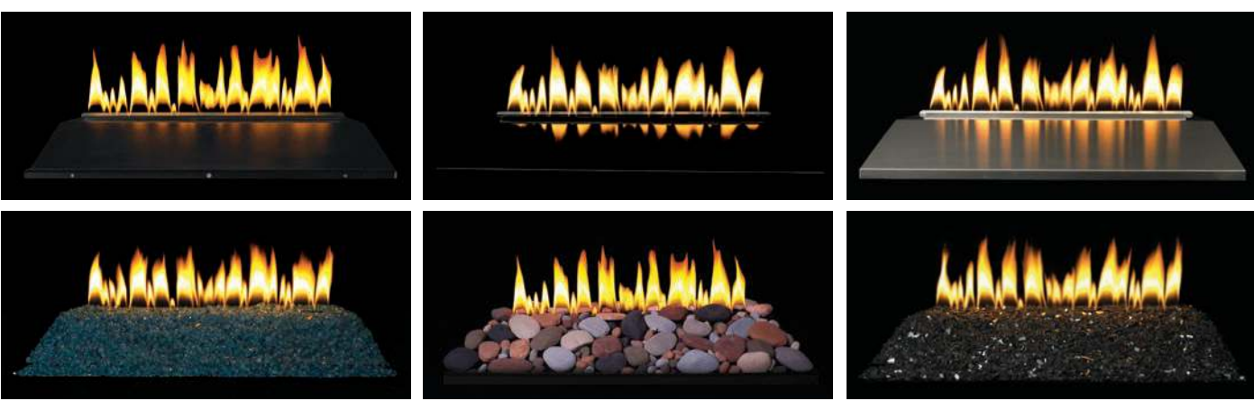
Top Row left to right: No Decorative Options, Polished Black Decorative Top, Brushed Stainless Steel Decorative Top. Bottom Row left to right: Blue Clear Decorative Glass, Medium Decorative Rocks and Accent Pebbles, Polished Black Decorative Glass. (Clear Frost Decorative Glass shown on opposite page)