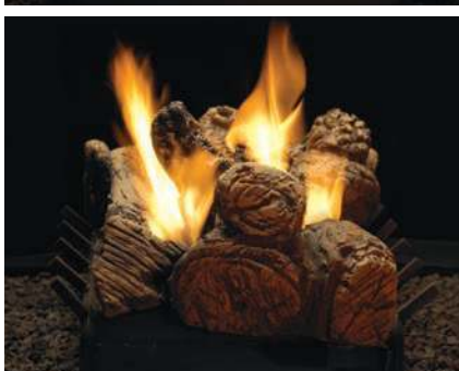
Opposite Side View (above) and End View (below)