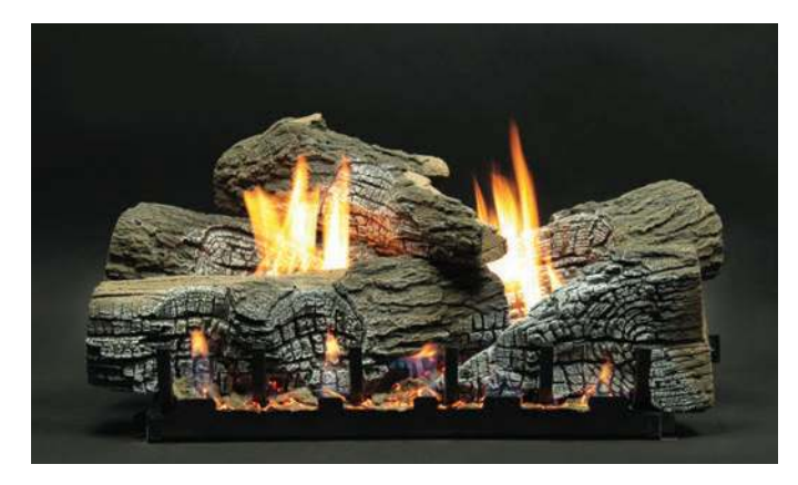
Stacked Wildwood Refractory Log Set (LS24WRR) with Vent-Free Slope Glaze Burner System (VFSR-24)