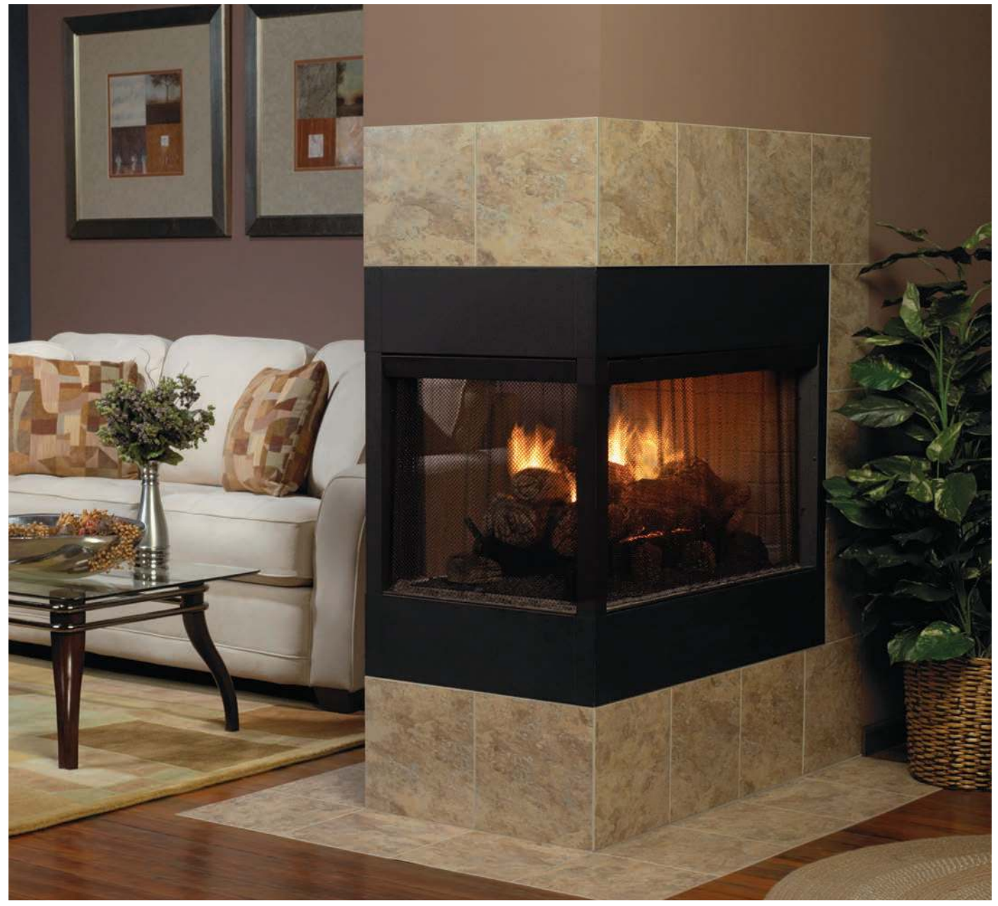
American Hearth Shiloh Log Set (LSU-24SF) on a Vent-Free Slope Glaze Vista Burner in a peninsula firebox with custom tile surround. The optional Log Embers Kit (EK-2) and Platinum Glowing Embers (PE20) add that extra spark of realism.