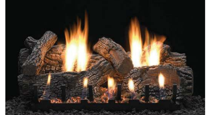
Charleston Refractory Log Set (ALS-24CRI) with Vent-Free Slope Glaze Burner System (VFSR-24)