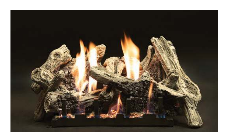
Driftwood Burncrete* Log Set (LS-18CD) with Vent-Free Slope Glaze Burner System (VFSR-18)