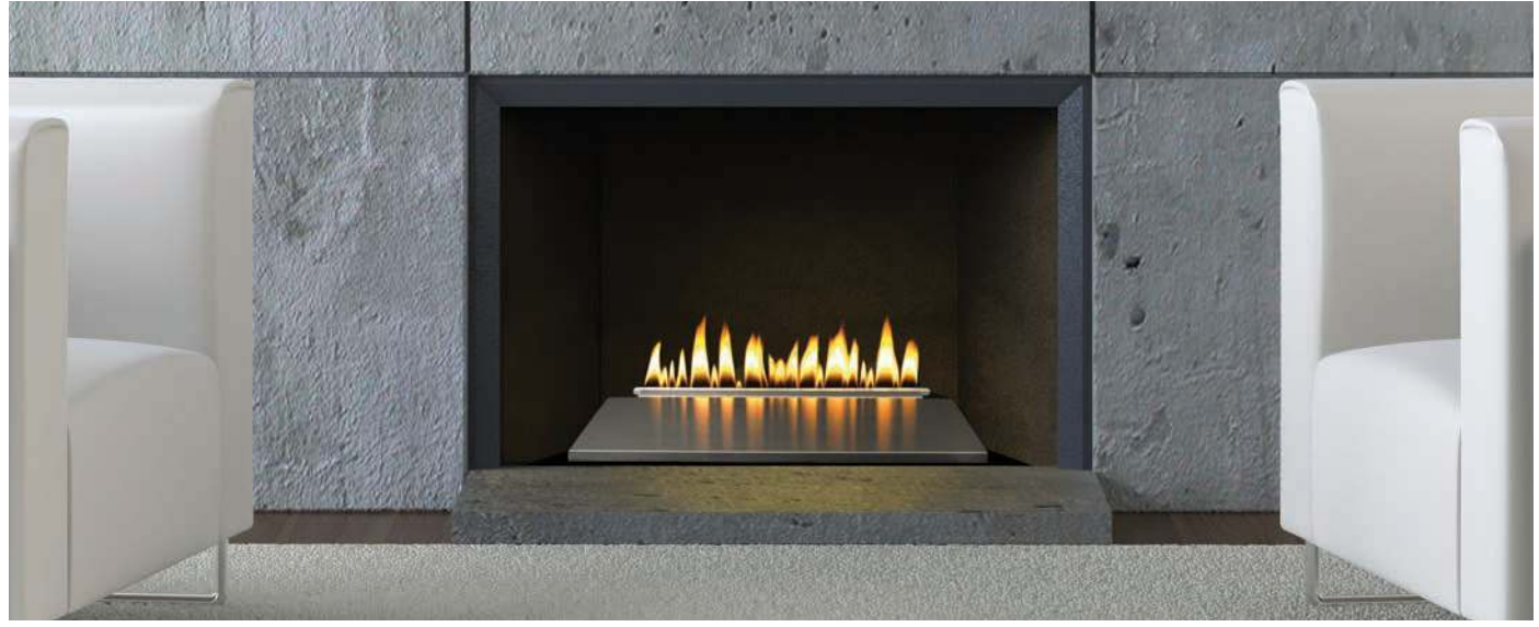
Loft Series Burner (VFRL-24) with Stainless Steel Decorative Top (DT-24-SS). Shown in existing masonry firebox.

A vent-free Millivolt Loft Burner may also be installed as a decorative appliance in a vented fireplace to provide ambiance and light – but without the heat. In a vented installation, the burner cannot be operated by thermostat and the flue damper must be blocked open. A damper clamp is included with each Millivolt Loft burner. Because IP Loft Burners include a thermostat and may not be installed as decorative appliances, a non-thermostat remote is available.