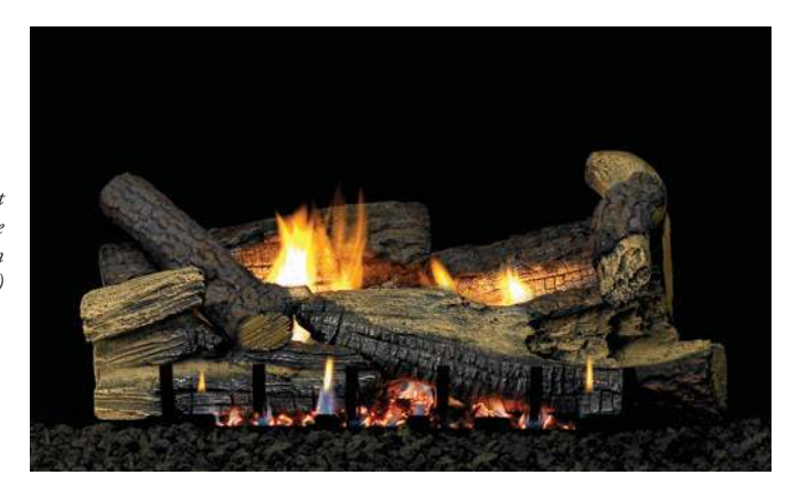
Refractory Yorktown Log Set (ALS-24YK) with Vent-Free Slope Glaze Burner System (VFSE-24)