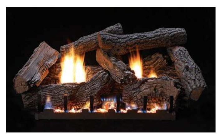
Charleston Select Refractory Log Set (ALS-24CR1S) with Vent-Free Slope Glaze Burner System (VFSR-24)