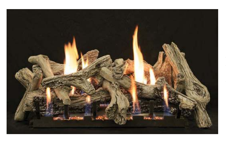
Driftwood Burncrete* Log Set (LS-24CD) with Vent-Free Slope Glaze Burner System (VFSR-24)