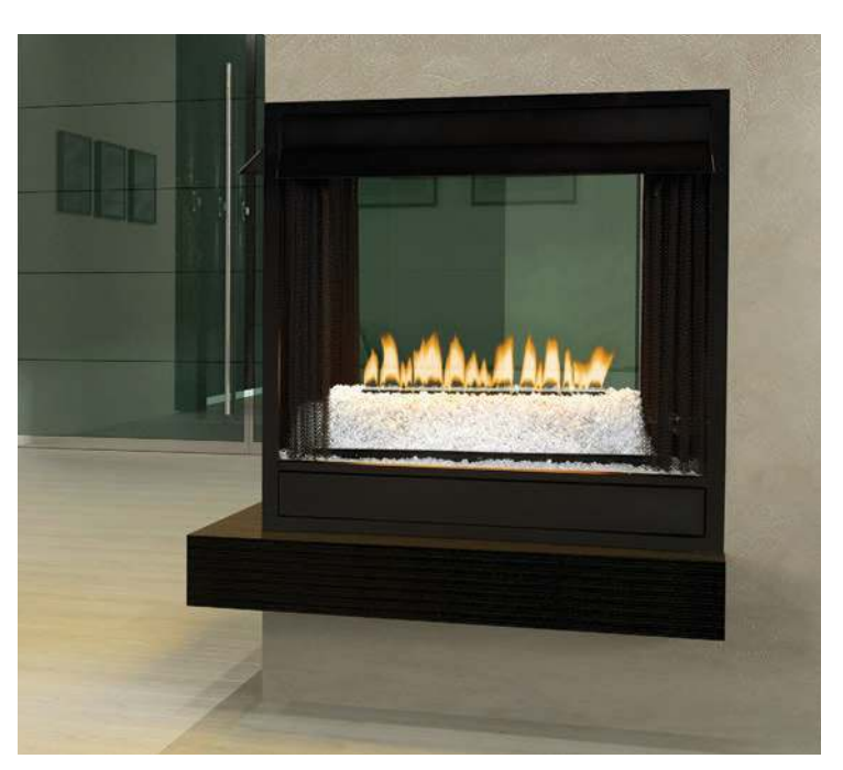
Loft Series Vent-Free Multi-sided burner (VFRU-24) with Clear Frost Decorative Glass (DG-30-CLF). Shown in a Vent-Free peninsula firebox with Flush Louvers.