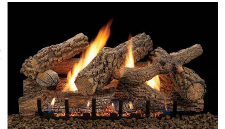
Saratoga Refractory Log Set (ALS-24SG) with Vent-Free Slope Glaze Burner System (VFSR-24)