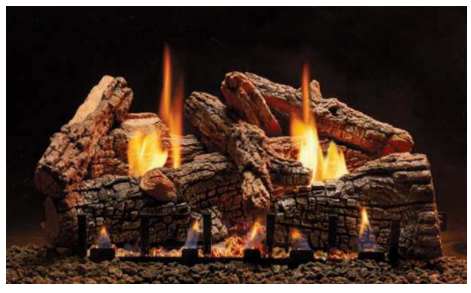
Ravenwood Select Refractory Log Set (ALS-24RVS) with Vent-Free Slope Glaze Burner System (VFSE-24)