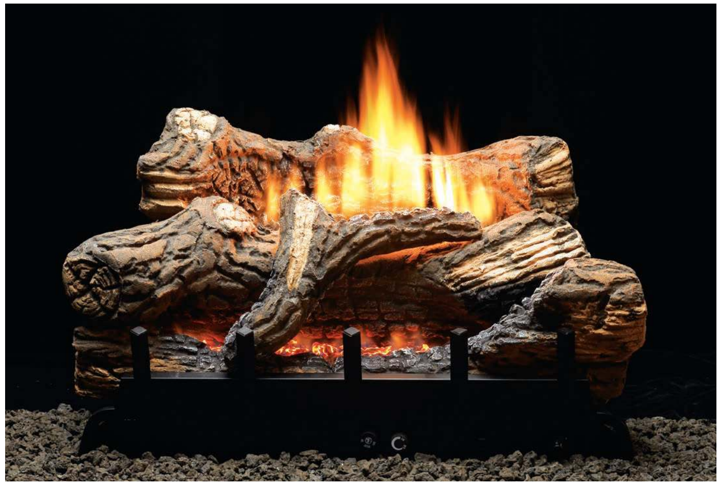
Trenton Ceramic Fiber Log Set and Vent-Free Burner Combination (VFDR-24LB)

The Trenton Log Set features richly detailed, hand-painted Ceramic Fiber logs mounted atop our Vent-Free Contour Burner. This complete set includes glowing embers to add to the illusion of a real wood fire at any heat setting. This competitively priced set is ideal for existing fireplaces and fireboxes and for new construction. Available in manual control, thermostat control, or remote-ready Millivolt – in 28,000 Btu, 34,000 Btu and 40,000 Btu.