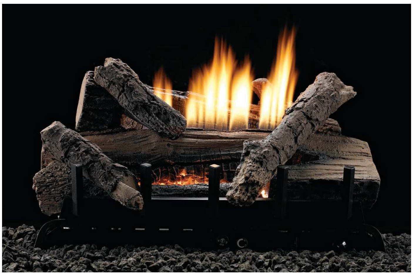
Concord Refractory Log Set and Vent-Free Burner combination (VFDR-18-LBW)

The Trenton and Concord are also offered in 10,000 Btu models for bedroom applications, where allowed by code.