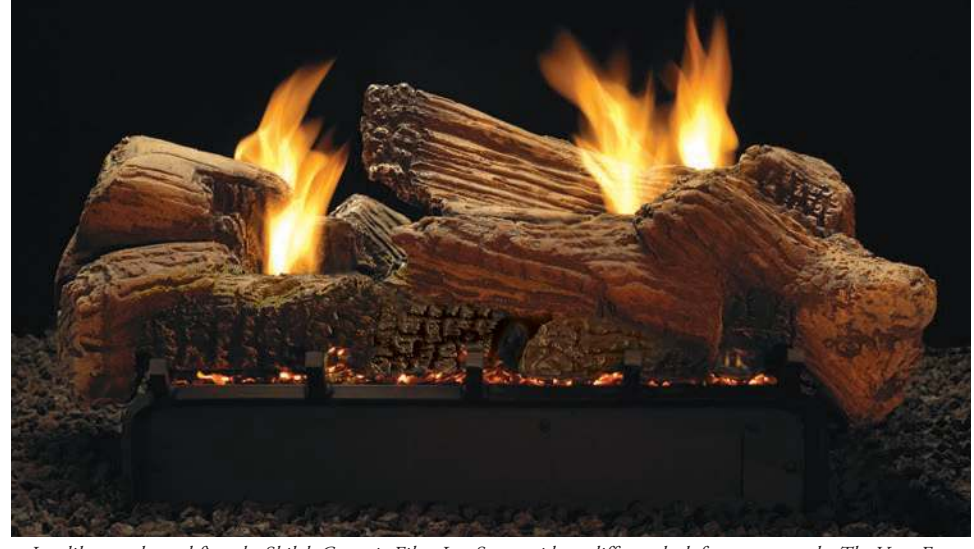
Just like a real wood fire, the Shiloh Ceramic Fiber Log Set provides a different look from every angle. The Vent-Free Slope Glaze Vista Burner neatly conceals its controls behind a sliding panel.