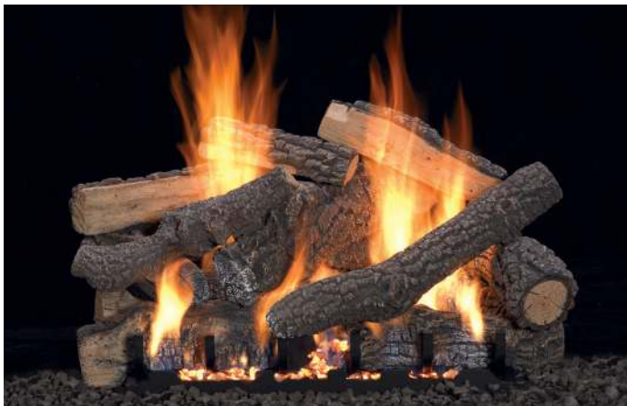
Williamsburg Refractory Log Set (ALS24CR2)