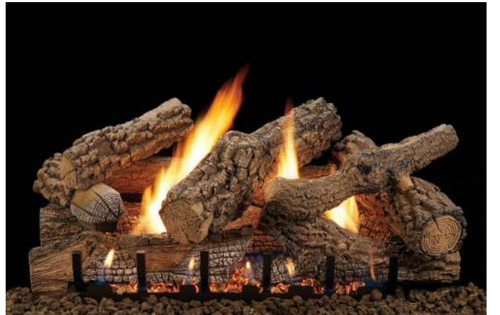
Saratoga Refractory Log Set (ALS24SG)