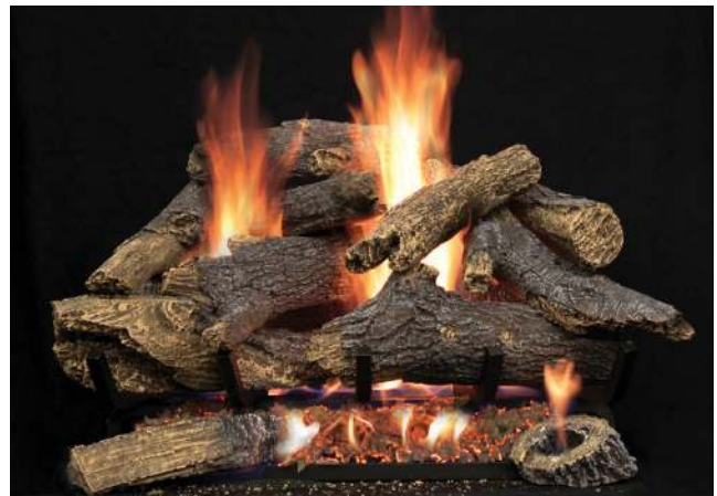
Pioneer (LPR) Refractory Log Set