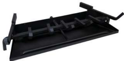
Double Burner (BX)