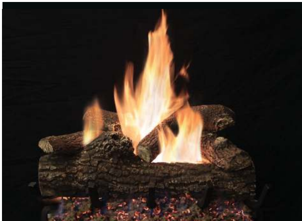
Great Lakes Oak (GLO) Refractory Log Set