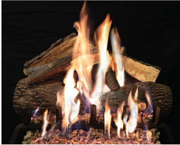
Advantage (LA) Refractory Log Set shown with Triple Burner