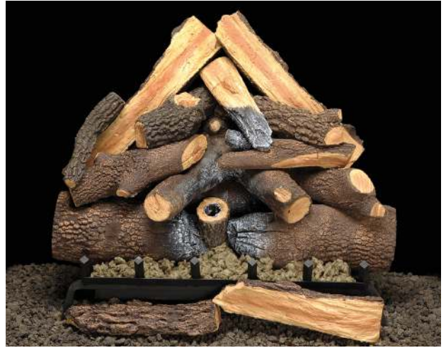
Advantage Refractory Log Set shown with Skyscraper (LAV) Accessory Refractory Logs