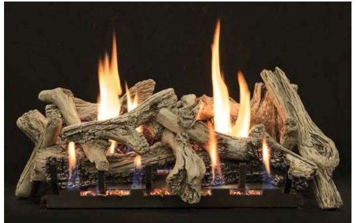
Driftwood Burncrete® Log Set (LS24CD)