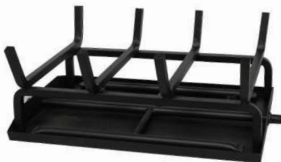
See-Through Burner (B3) (requires See-Through Log Set)