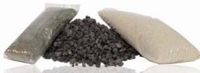
Embers, Rock and Sand (included with all Double and See-Through Burners)