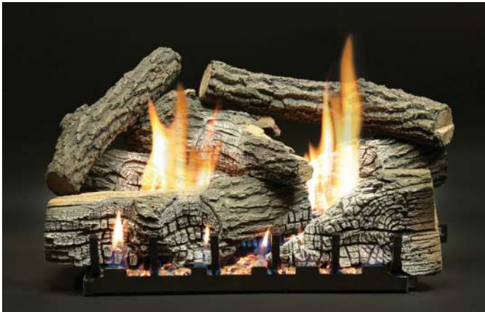
Super Stacked Wildwood Refractory Log Set (LS24WRS)