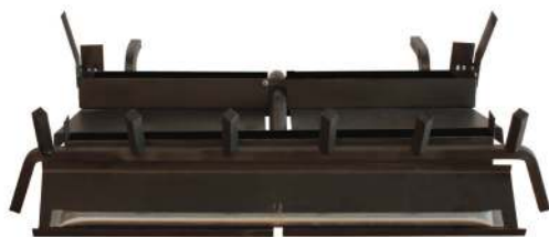
Triple Burner (AV)