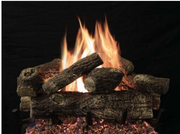
Treehouse 7 (LTH7) Refractory Log Set