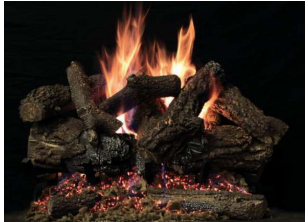
Treehouse 11 (LTH11) Refractory Log Set