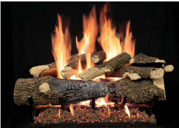
Frontier (LFR) Refractory Log Set