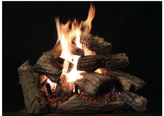
Kensington Forest (LKF) Ceramic Fiber Log Set