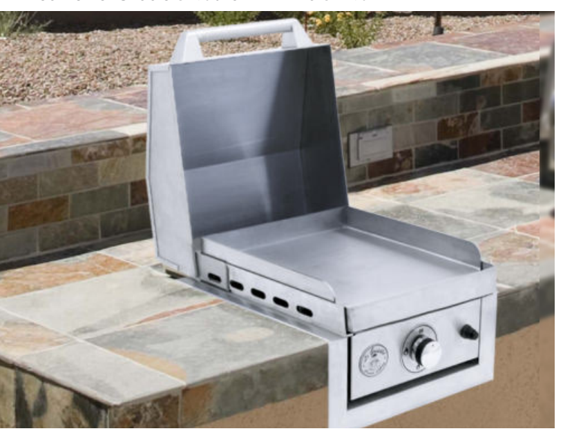
Single Burner Griddle GFE40 shown with trim kit GFFRAME40 & lid GFLID40