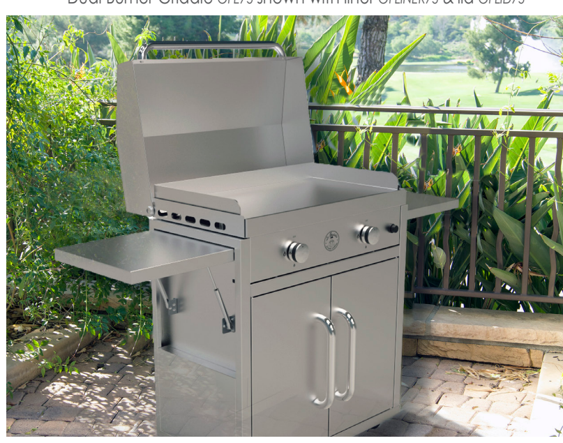
Dual Burner Griddle GFE75 shown with cart GFCART75 & lid GFLID75