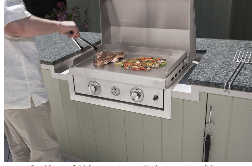
Dual Burner Griddle GFE75 shown with liner GFLINER75 & lid GFLID75