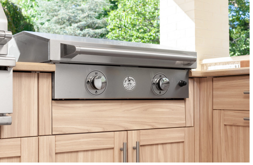
Dual Burner Griddle GFE75 shown with lid GFLID75