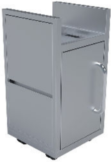
Wee Cart - GFCART40 Cart Cover: GFCARTCOVER40