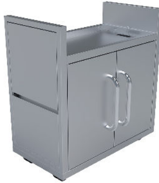
Ranch Hand Cart - GFCART75 Cart Cover: GFCARTCOVER75