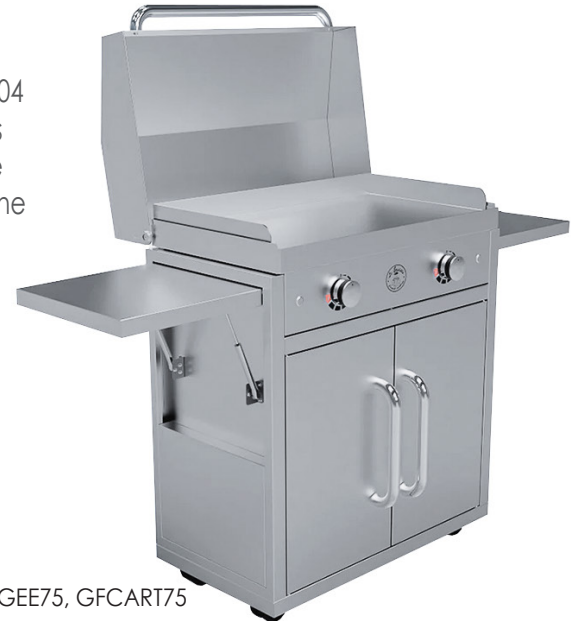
Shown: GFLID75 , GEE75 , GFCART75

Make your griddle portable, made of 304 stainless steel. Two foldable side shelves equipped with hydraulic support. Large storage doors provide space for propane tank, cooking equipment and outdoor kitchen necessities. Four large casters make moving the cart easy and effortless. The GFCART160 offers even more storage with two doors & drawers.