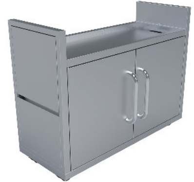
Big Texan Cart - GFCART105 Cart Cover: GFCARTCOVER105