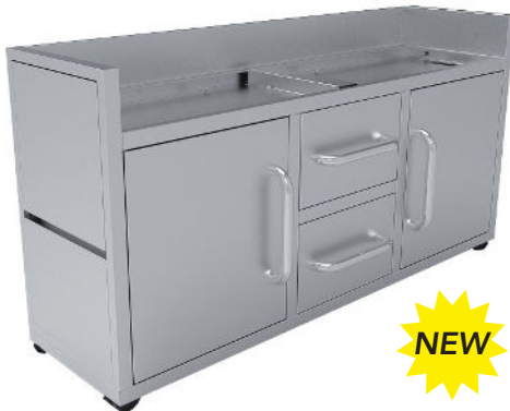
Grand Texan Cart - GFCART160 Cart Cover: GFCARTCOVER160

Make your griddle portable, made of 304 stainless steel. Two foldable side shelves equipped with hydraulic support. Large storage doors provide space for propane tank, cooking equipment and outdoor kitchen necessities. Four large casters make moving the cart easy and effortless. The GFCART160 offers even more storage with two doors & drawers.