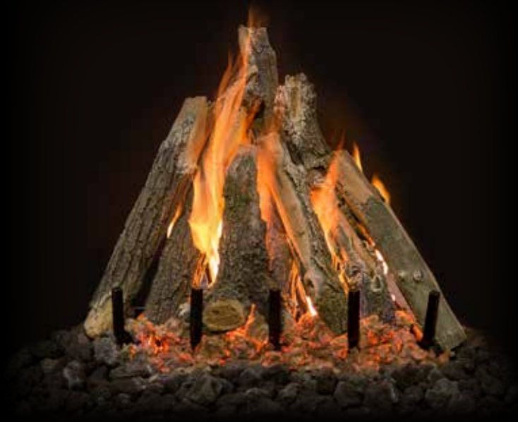
Kiva Arizona Weathered Oak (AWO)