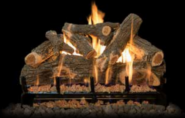
3-Burner Arizona Weathered Oak 30"