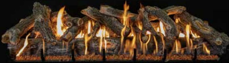
2-Burner Arizona Weathered Oak 60"