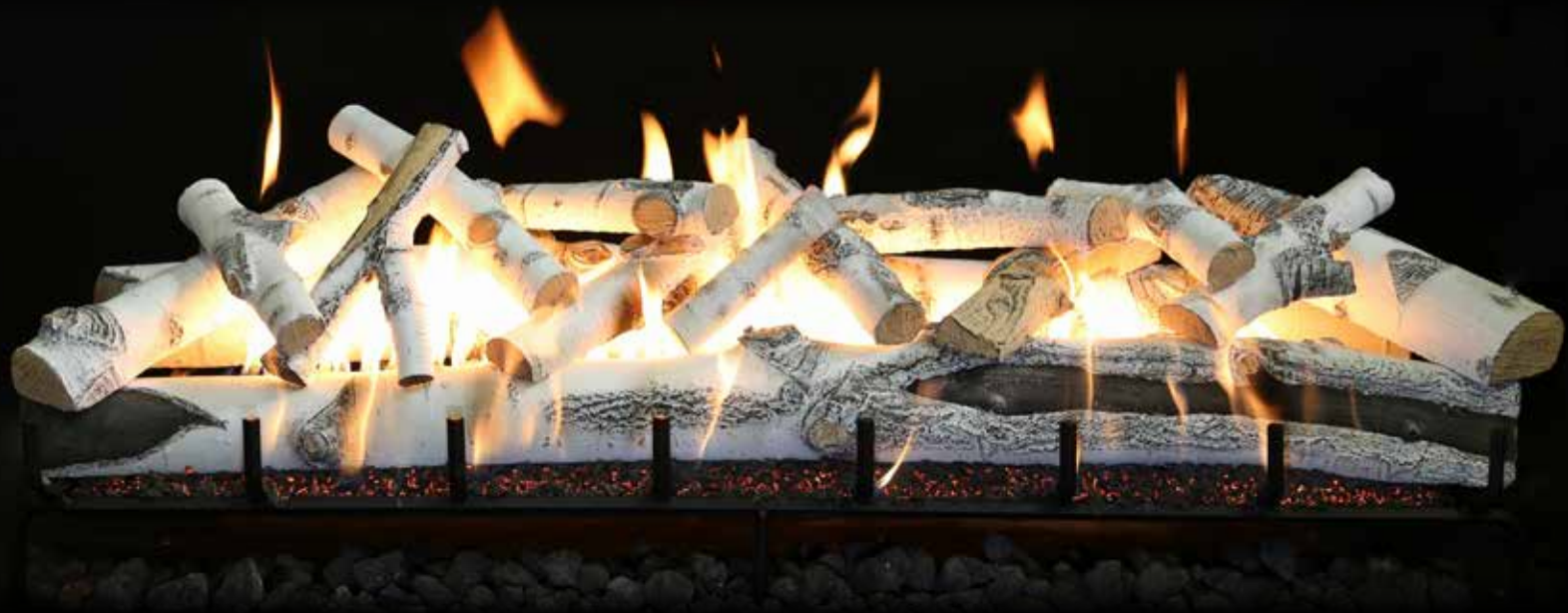
2-Burner Quaking Aspen 60"