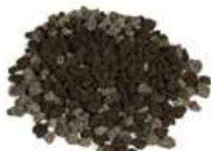
Lava Granules Available in 10 lb. Bags Item # HP-B-GR-10