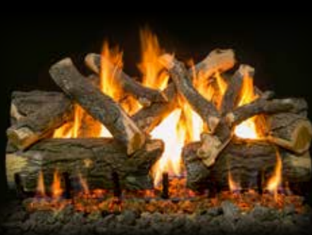
3-Burner Arizona Weathered Oak Charred 36"