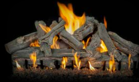
2-Burner Arizona Western Driftwood 42"