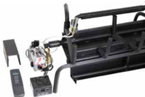
Assembled burner natural gas with millivolt and remote system. 3BRN-##-**-MVK-GCRK