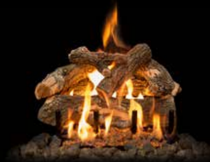
2-Burner Arizona Weathered Oak 18"