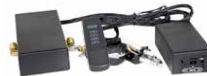
120K Natural Gas BTU Rating 140 K Propane BTU Rating Item # MVKEIKLP or MVKEIKN