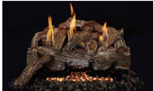
24" Red Oak Gas Logs