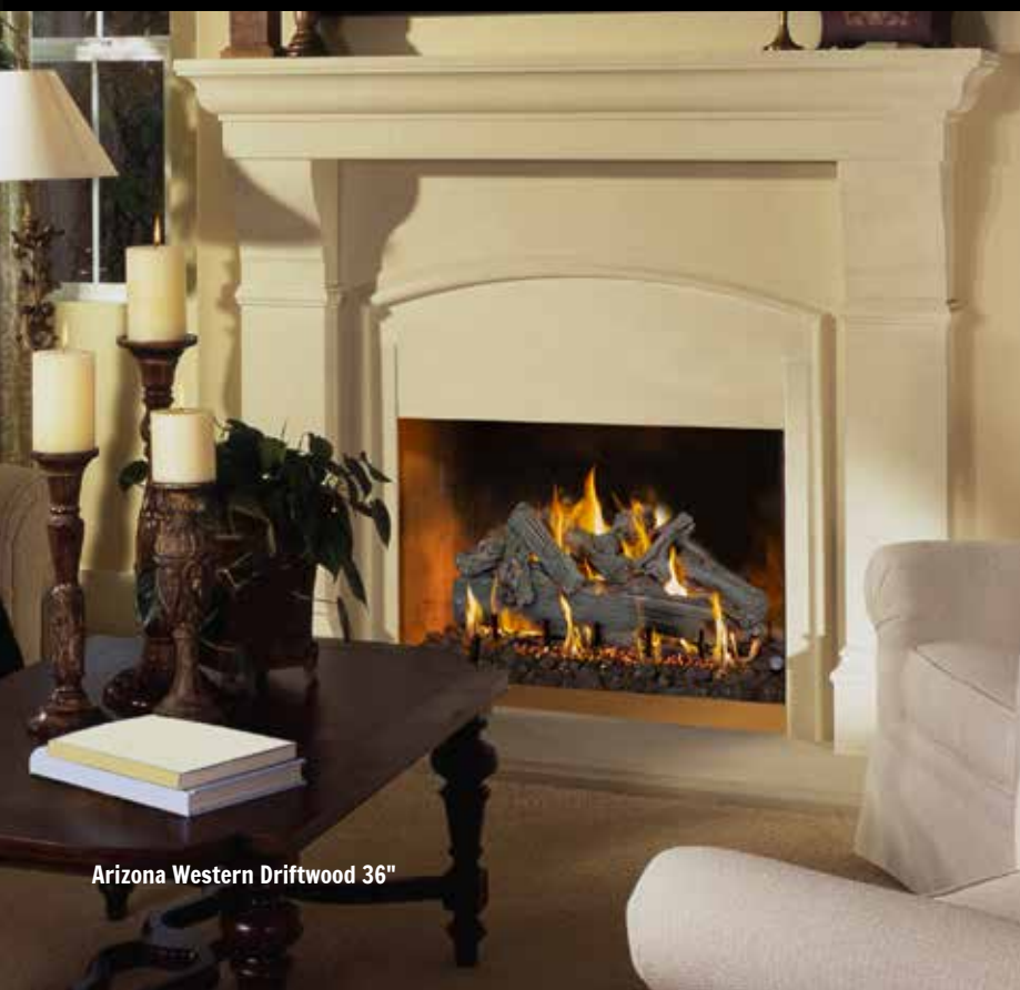
Arizona Western Driftwood 36"