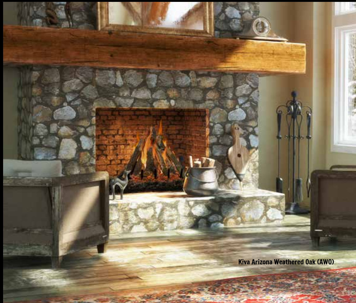
Kiva Arizona Weathered Oak (AWO)