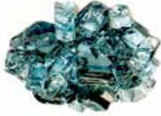
Adriatic Topaz Item # RFG-10-AT