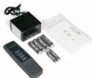
85K BTU Rating Item # GCRK