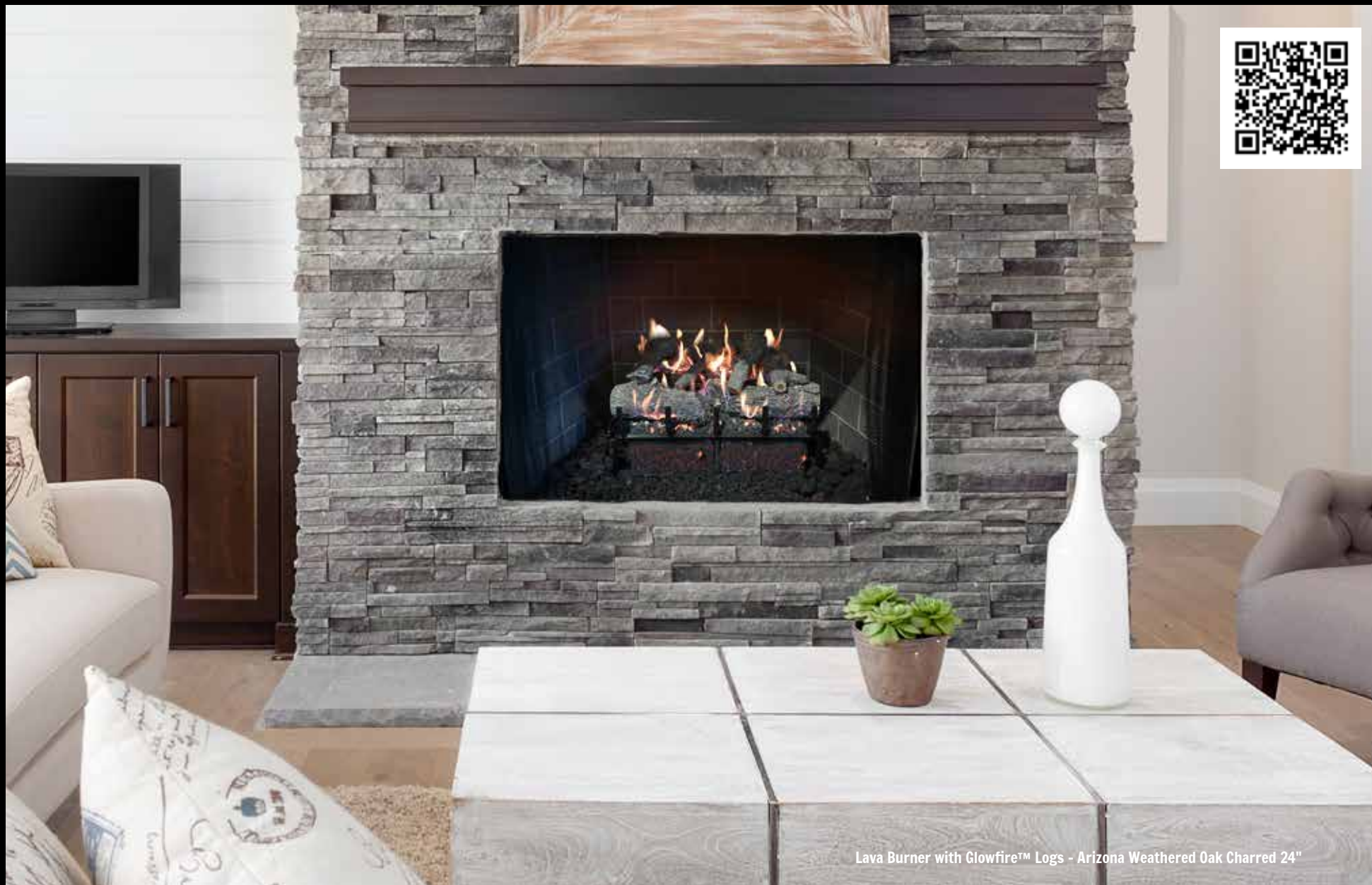
Lava Burner with Glowfire™ Logs - Arizona Weathered Oak Charred 24"