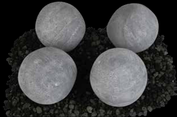
6" Cannonballs - Gray shown