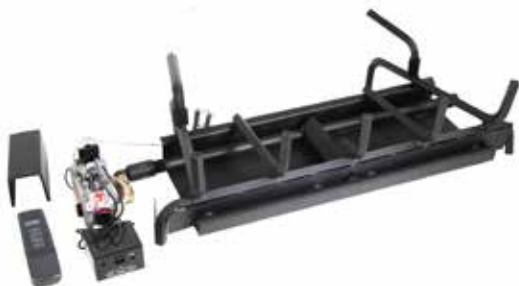
Assembled burner natural gas with millivolt and remote system. 2BRN-##-**-MVK-GCRK