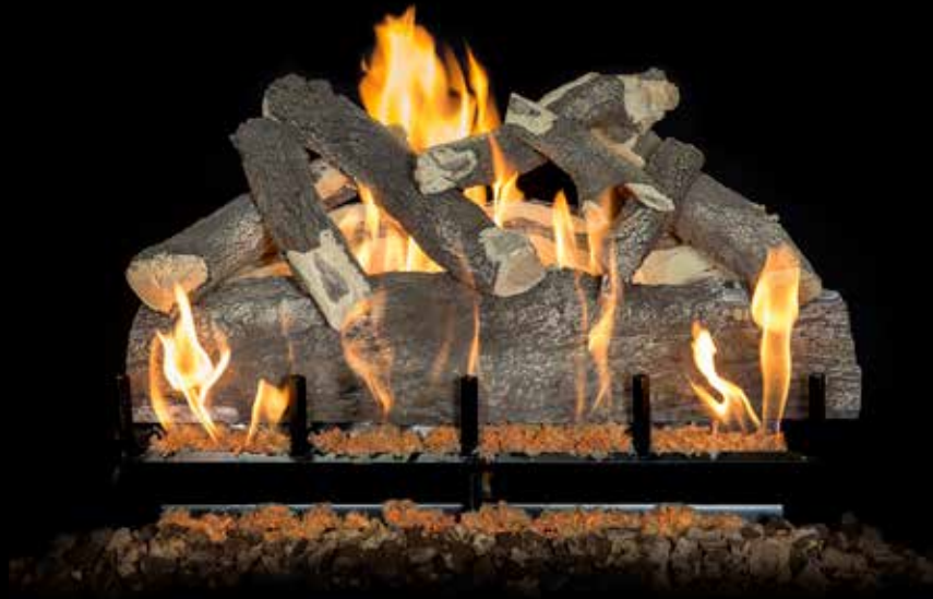
3-Burner Blue Pine Split 30"