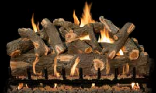
3-Burner Arizona Weathered Oak 42"