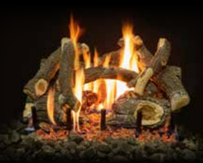
2-Burner Arizona Weathered Oak Charred 24"