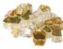
Amber Diamond Item # RFG-10-AG