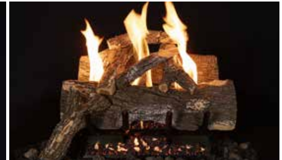
18" Weathered Oak Gas Logs