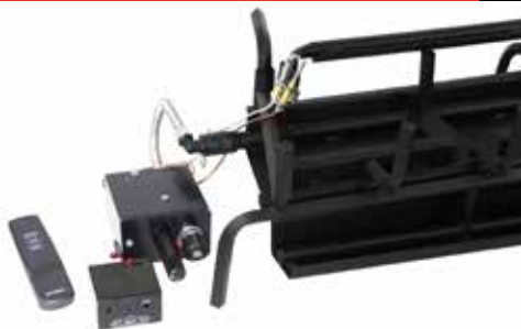
Assembled burner natural gas with modulating millivolt and remote system. 3BRN-##-**-MMVR