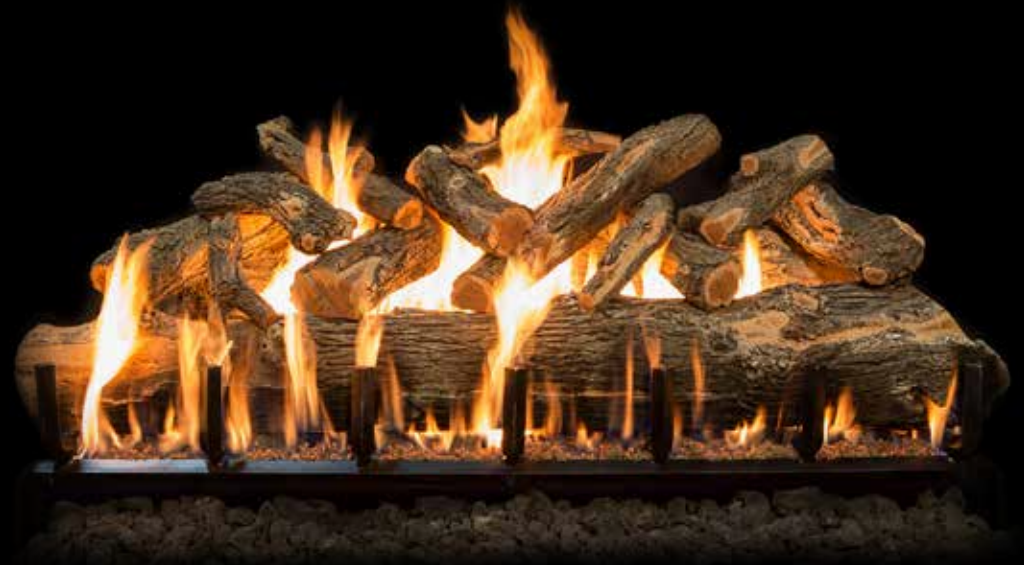
Jumbo-Burner - Jumbo Arizona Weathered Oak 60"