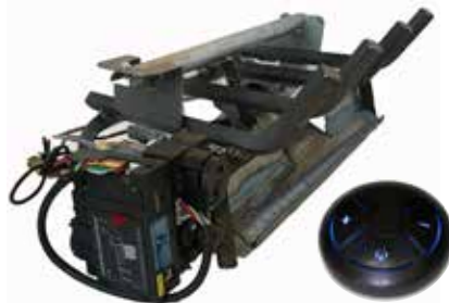
IPI Electric with Burner Puck Remote included with this Variable Electric model only.