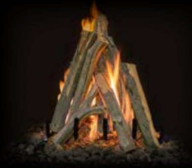
Kiva Arizona Juniper (AJ)