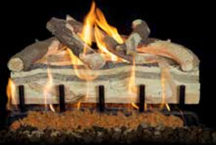
2-Burner Blue Pine Split 24"