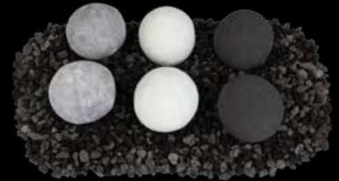
4" Cannonballs - Gray - White - Black