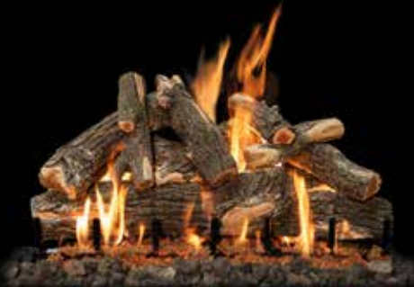
2-Burner Arizona Weathered Oak 36"