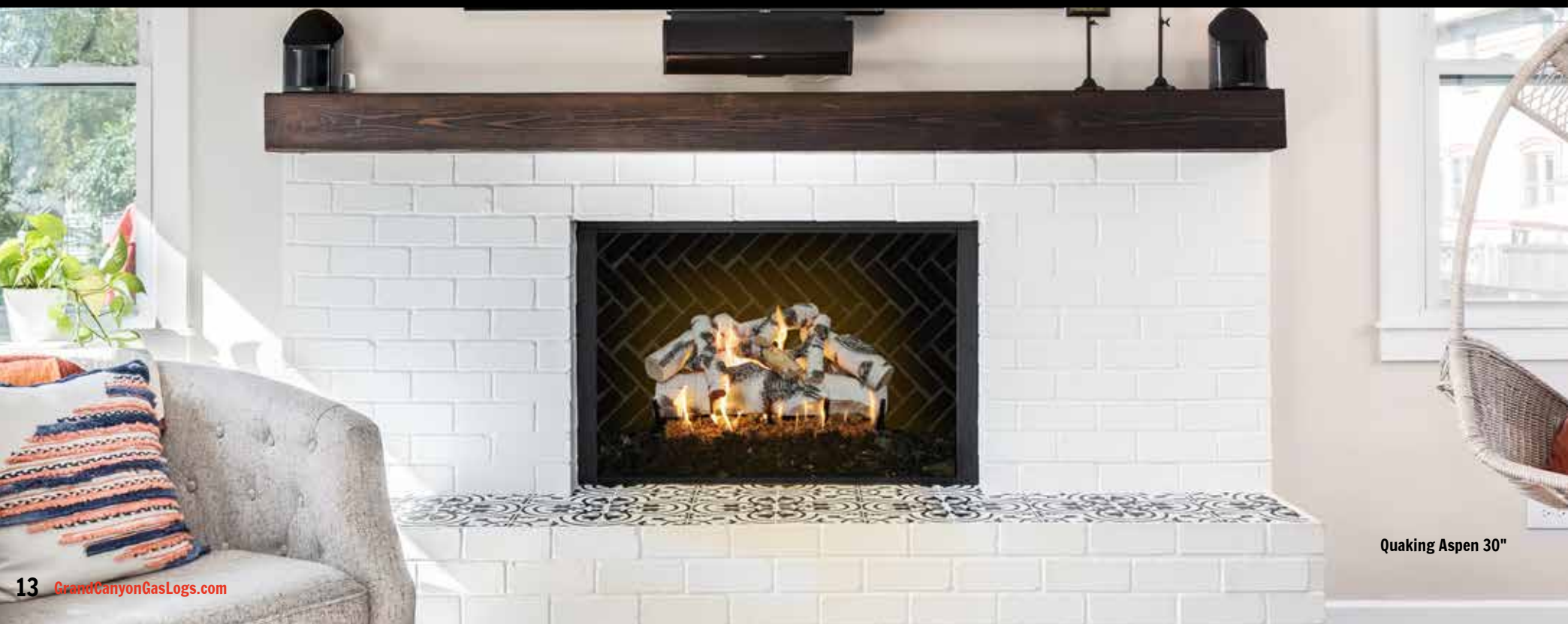
Quaking Aspen 30"