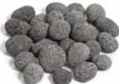
2"- 3" Lava Pebbles Available in 50 lb. Bags Item # NL-5080