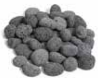
1"- 2" Lava Pebbles Available in 50 lb. Bags Item # NL-3050