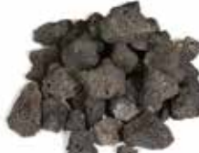
Lava Rock Available in 10 lb. Bags Item # HP-B-R-10