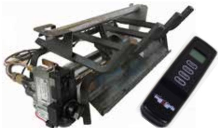
Variable Control with Burner & Remote