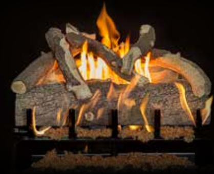
3-Burner Blue Pine Split 24"