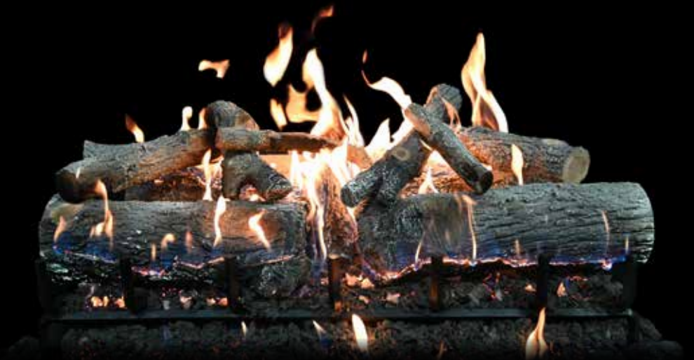
Lava Burner Series - GlowFire™ Logs AZ Weathered Oak Charred 36"