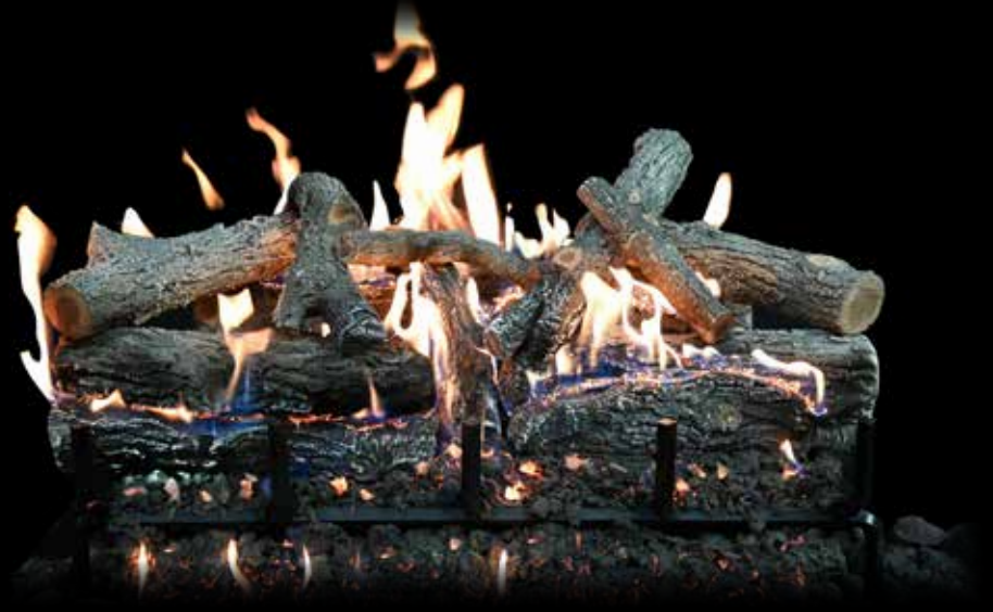
Lava Burner Series - GlowFire™ Logs AZ Weathered Oak Charred 30"