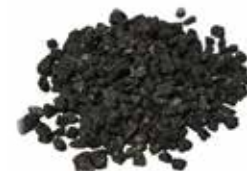
6 oz Bag Item # VEM-6