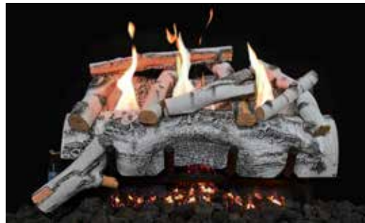
NEW 24" Aspen Birch Gas Logs