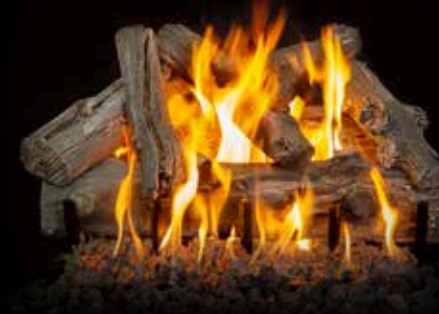
2-Burner Arizona Western Driftwood 24"