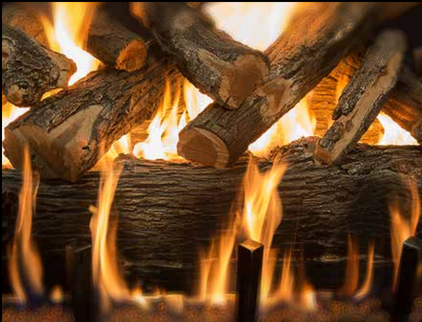
Jumbo-Burner - Jumbo Arizona Weathered Oak 60"