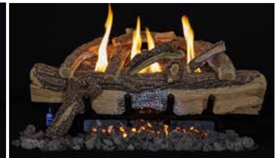
30" Split Oak Gas Logs