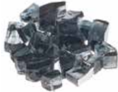
Vesper Black Item # RFG-10-VB