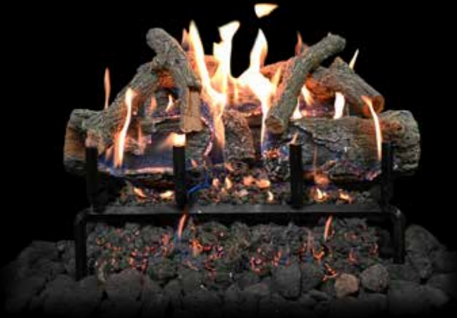
Lava Burner Series - GlowFire™ Logs AZ Weathered Oak Charred 18"