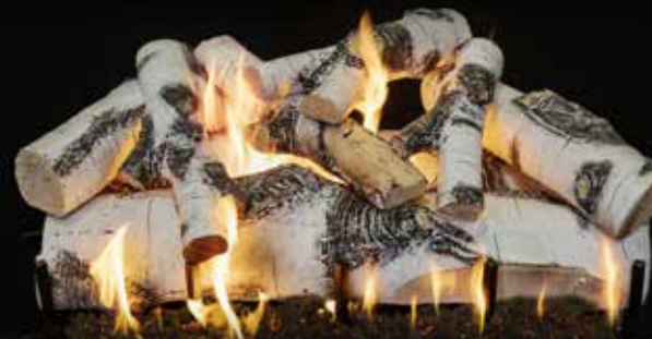
2-Burner Quaking Aspen 30"