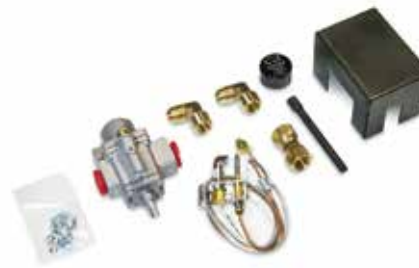
142K BTU Rating Item # HCSPK-LP or HCSPK-N