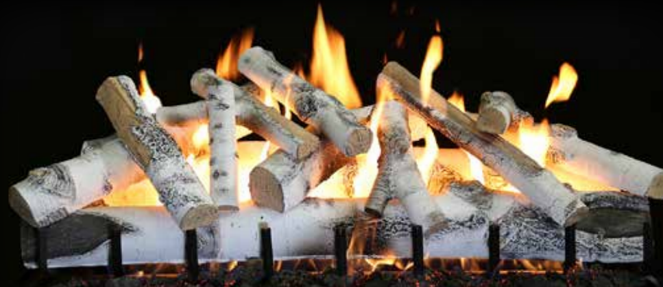
2-Burner Quaking Aspen 42"