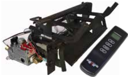
Standard Millivolt with Burner & Remote