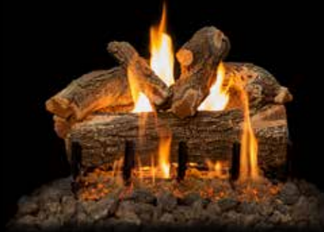
2-Burner Arizona Weathered Oak 21"