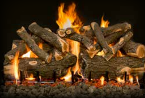
3-Burner Arizona Weathered Oak Charred 42"