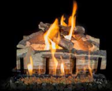
2-Burner Blue Pine Split 18"