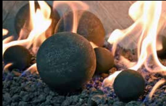
Fireplace Fiber Cannonballs