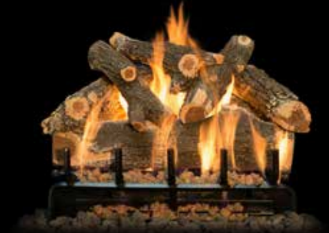
3-Burner Arizona Weathered Oak 24"