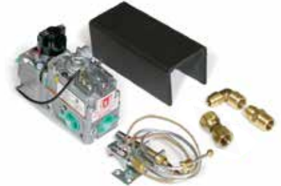
82K Natural Gas BTU Rating 110K Propane BTU Rating Item # MVQMKLP or MVQMKN