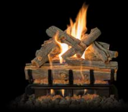
3-Burner Arizona Juniper 21"