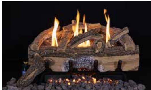
24" Split Oak Gas Logs