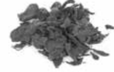
6 oz Bag Item # GLE-6B