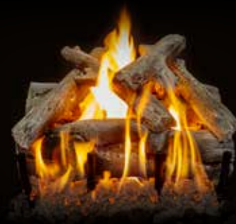
2-Burner Arizona Western Driftwood 18"

Arizona Western Driftwood (WD) Available in 18", 21", 24", 30", 36" and 42". Front View and See-Through. Burner compatibility 2 and 3 burner.