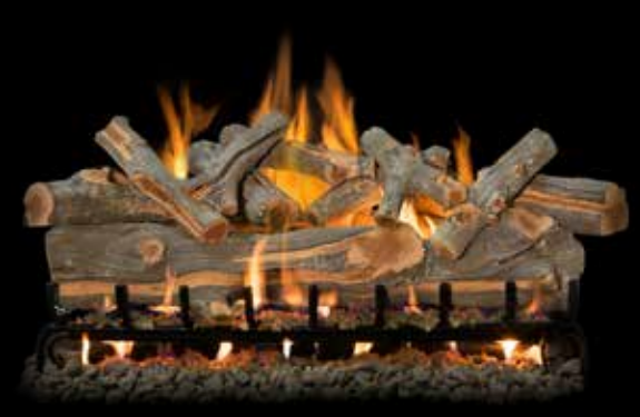
3-Burner Arizona Juniper 42"