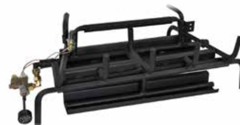
Assembled burner natural gas with safety pilot system. 3BRN-##-**-SP