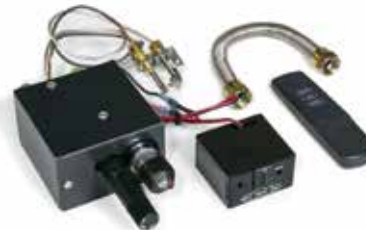
120K (NG & LP) BTU Rating Item # MMVKR-LP or MMVKR-NG