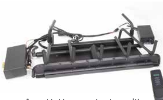
Assembled burner natural gas with battery electronic and remote system. 2BRN-##-**-MVKEI-GCRK