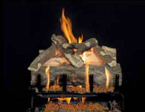
3-Burner Blue Pine Split 18"