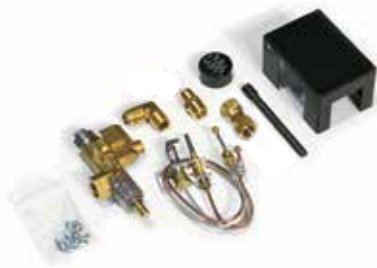
90K BTU Rating Item # SPQMKLP or SPQMKN