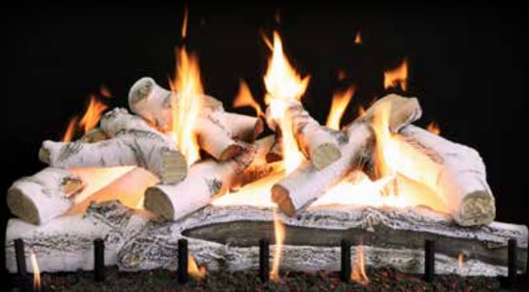
2-Burner Quaking Aspen 36"