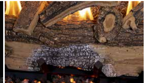
Realistic hand-painted charred logs