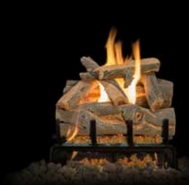
3-Burner Arizona Juniper 18"