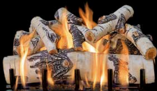
2-Burner Quaking Aspen 24"