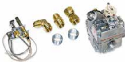
240K Natural Gas BTU Rating 320K Propane BTU Rating Item # HCMVQMKLP or HCMVQMKN