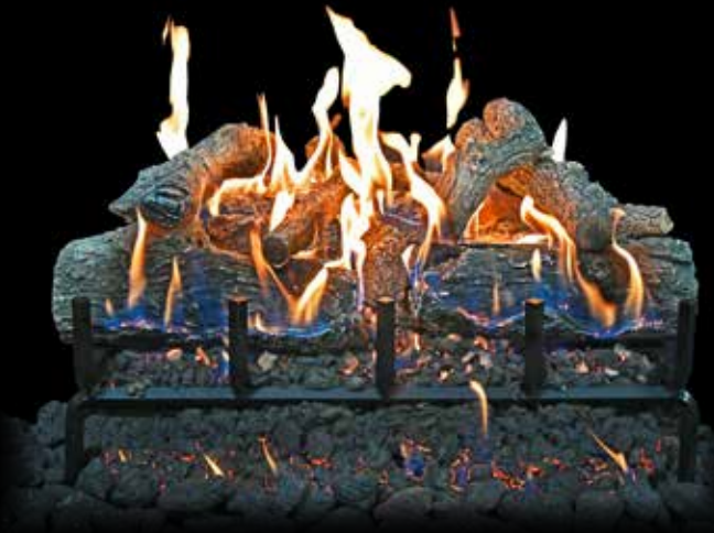
Lava Burner Series - GlowFire™ Logs AZ Weathered Oak Charred 24"