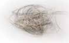
1 Gram Item # GLW-1