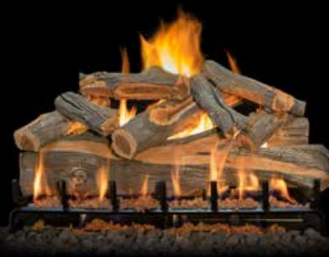
3-Burner Arizona Juniper 36"