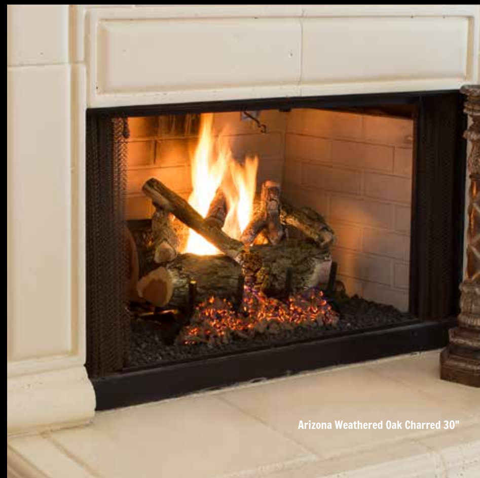
Arizona Weathered Oak Charred 30"