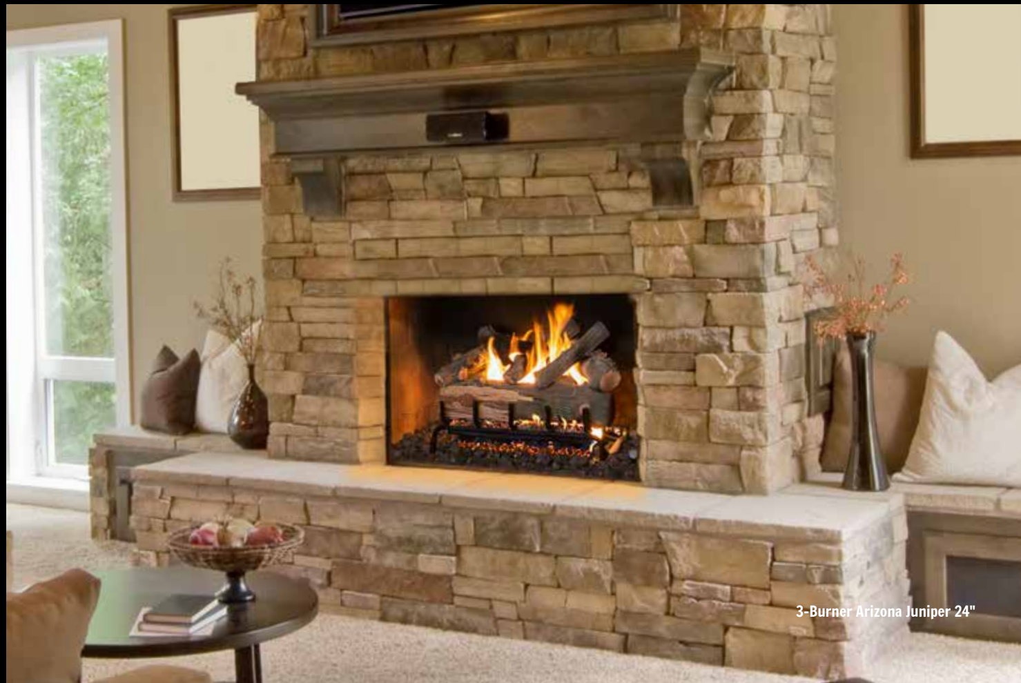
3-Burner Arizona Juniper 24"