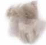
1 Gram Item # PEB-1