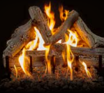
2-Burner Arizona Western Driftwood 21"