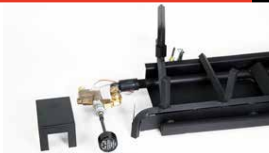
Assembled burner natural gas with safety pilot system. 2BRN-##-**-SP