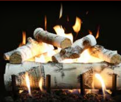
2-Burner Quaking Aspen 18"