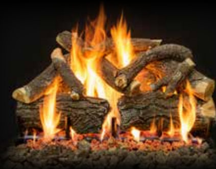
2-Burner Arizona Weathered Oak Charred 30"