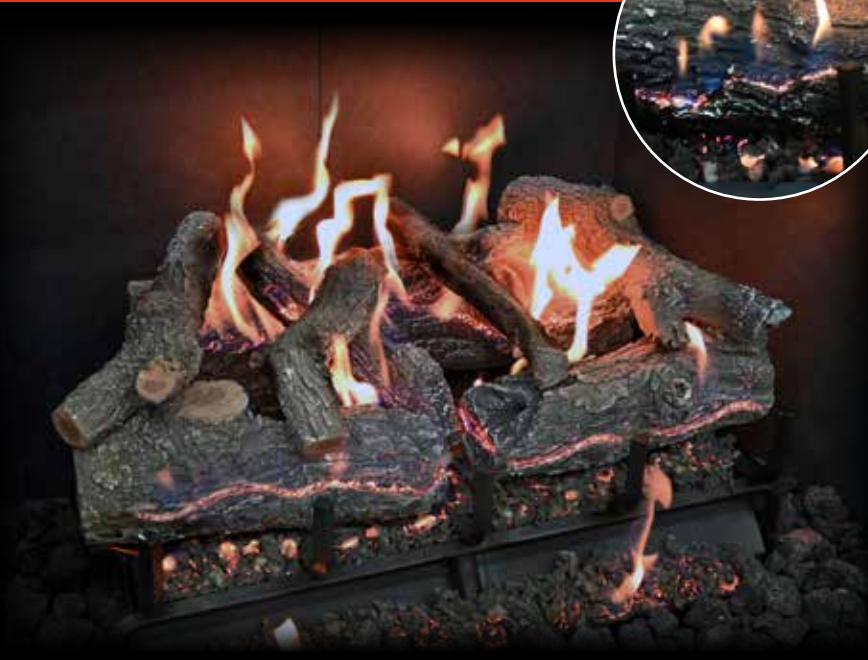
Lava Burner Series - GlowFire™ Logs AZ Weathered Oak Charred 24"