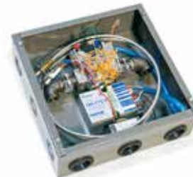
200K Natural Gas BTU Rating 320K Propane BTU Rating Item # EIS, EIS-LP, EIS-10 or EIS -LP-10