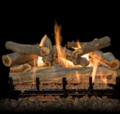
3-Burner Arizona Juniper 30"