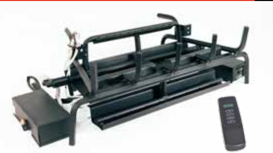
Assembled burner propane with battery electronic and remote system. 3BRN-##-**-MVKEI-GCRK