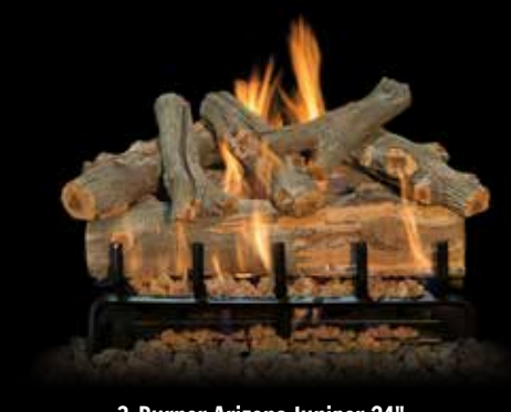
3-Burner Arizona Juniper 24"