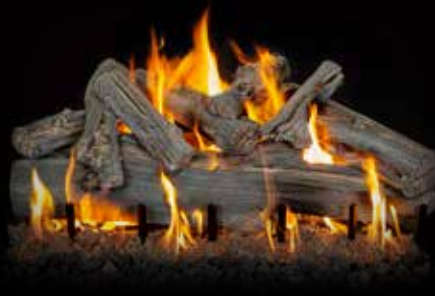
2-Burner Arizona Western Driftwood 36"