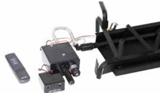
Assembled burner natural gas with modulating millivolt and remote system. 2BRN-##-**-MMVR