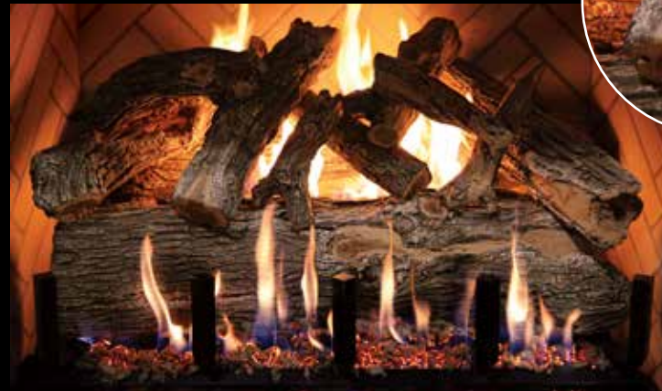
Jumbo-Burner - Jumbo Arizona Weathered Oak 36"