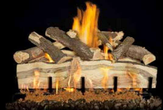
2-Burner Blue Pine Split 30"